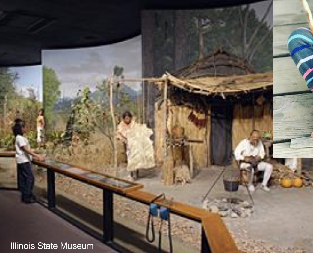
Illinois State Museum